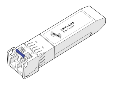
Figure 1. SFP Dual Fiber (non-binding illustration)