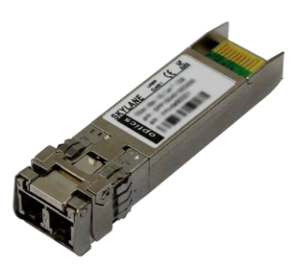
Figure 1. SFP+ Dual Fibre (non-binding illustration)