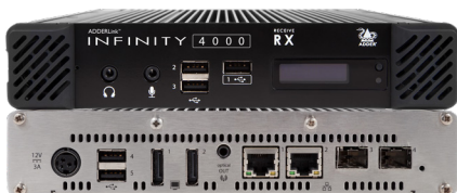
ALIF4000 RX - Front & Rear