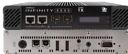
ALIF4000 TX - Front & Rear