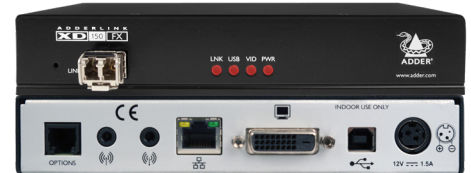
XD150FX TX - Front & Rear