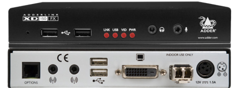
XD150FX RX - Front & Rear