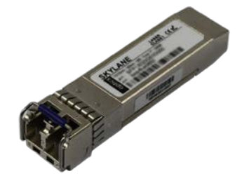
Figure 1. SFP Dual Fibre 850nm (non-binding illustration)