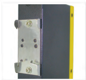
Panel Mounting Bracket C03-4006-101