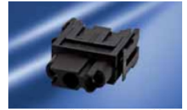
View represents all available contact positions.

Subseries Heavy duty connector heavy|mate® - C146 F