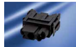
View represents all available contact positions.

Subseries Heavy duty connector heavy|mate® - C146 F