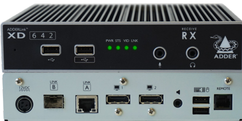
ADDERLink XD642 RX - Front & Rear

CAT6 is recommended for CATx extensions. CATx extensions are limited to 2 short patch connections. Patch cables should be CAT6 or better.