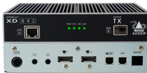
ADDERLink XD642 TX - Front & Rear