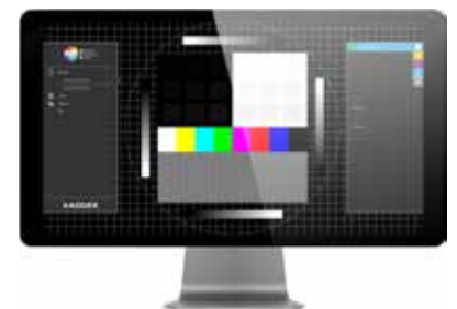
Pictured above: Adder DVA calibration software as part of the Virtual Control App

Adder DVA is supplied with a Virtual Control Panel (VCP) app which allows brightness, tone and sharpness to be adjusted. Vertical and horizontal video alignment can also be adjusted, where necessary. The VCP app contains a test pattern to accurately display the changes. EDID management options can also be changed and the EDID's of the monitors can be displayed.