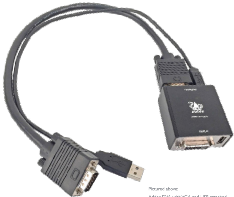
Pictured above: Adder DVA with VGA and USB attached

1 x Adder DVA module 1 x 41cm VGA cable (male to male) 1 x 45cm USB A to B cable